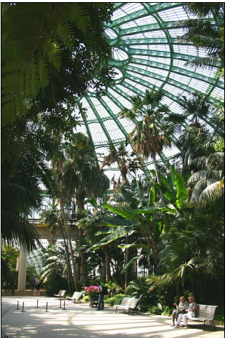
Royal Gardens, Laeken