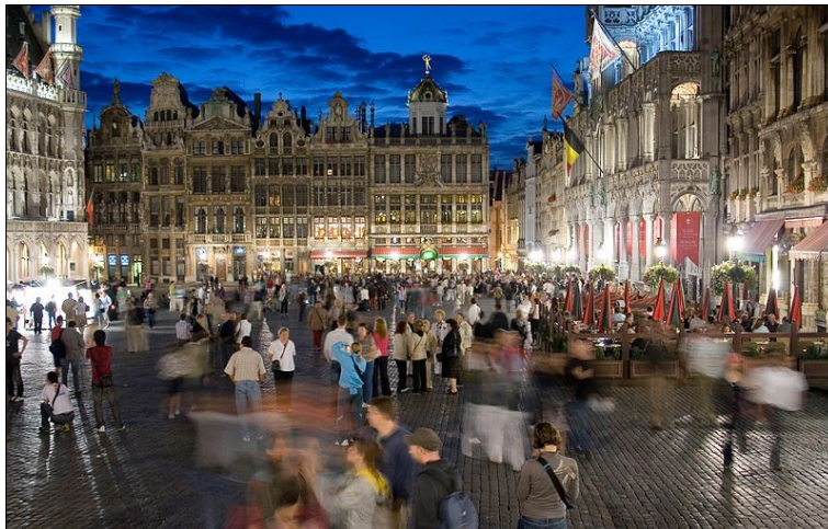
The Grand Place, Brussels