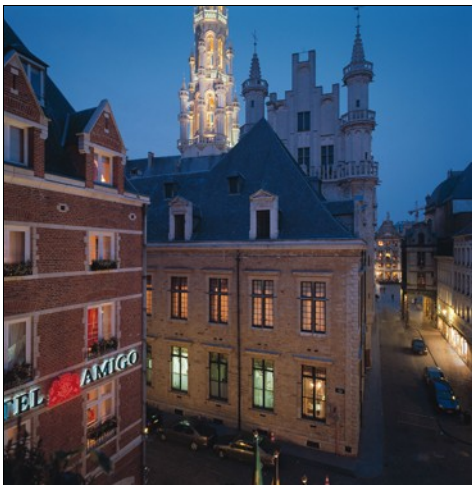
Hotel Amigo, Brussels

Hotel Amigo, Brussels Perfectly situated on a quiet street next to the Grand Place, the heart and soul of Brussels, Hotel Amigo is a splendid, five-star property that is within walking distance of all the major attractions in Brussels. The leading hotel in Brussels, the Amigo is a fitting base for our group as each of the 173 guest rooms is luxuriously furnished and features prints by surrealist artists René Magritte and Marcel Broodthaers. Rocco Forte Hotel Group, a name associated with cosmopolitan elegance and refined service, manages this recently-restored property. Guestrooms feature art deco and contemporary styling, while common areas include an eighteenth-century Flanders wall tapestry. Amenities include wi-fi internet in public areas, a fitness center, a restaurant serving contemporary Italian cuisine, and the Amigo Bar, which has an impressive list of whiskies and martini cocktails. Hotel Amigo is a member of the The Leading Hotels of the World. www.hotelamigo.com