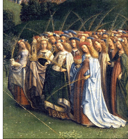
Virgin saints, detail from the Ghent Altarpiece