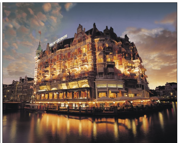
Hotel de l'Europe, Amsterdam

Hotel Heritage, Bruges Affiliated with the Relais & Chateaux collection of exquisite properties, Bruges' twenty-four-room Hotel Heritage is a charmingly authentic property that will immerse you in the historic culture of Bruges. This boutique hotel dates to the nineteenth century, when it was built as a private mansion.