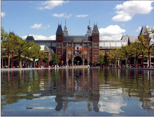
The Rijksmuseum in Amsterdam

Our last stop of the day is to the home of Anne Frank, a young Jewish girl who lived in the attic with her family for two years during the German occupation of the Netherlands in World War II and wrote the deeply moving diary that became one of the world's most widely read and cherished books. We end our trip with a festive dinner at an atmospheric and popular traditional Dutch restaurant – just the spot for a healthy bit of end-of-trip conviviality. Breakfast and dinner included