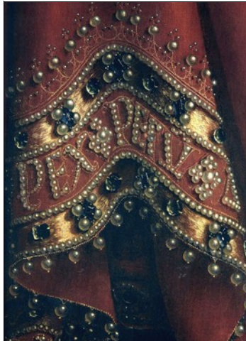
Opulent detail from the Ghent Altarpiece