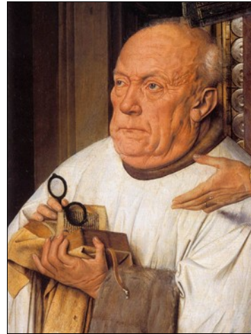
A picturesque canal in Bruges and a detail from the Madonna with Canon van der Paele , Groeningemuseum, Bruges