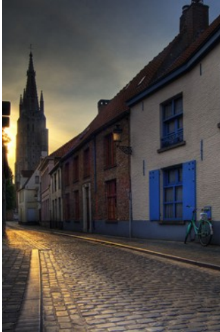
Bruges at sunset

Nouveau movement. One of the pioneers was Belgian architect and designer Victor Horta. We visit the house that Horta built for himself, notable for its swirling ironwork, elaborate masonry, and revolutionary use of natural light. We will walk through the Saint-Gilles district to see some of the art nouveau structures and visit the Hotel Hannon, an elegant town home from 1902 that houses contemporary photographic art exhibitions. This evening, we convene at an estaminet , one of Brussels' character-filled beer parlors, for a tasting of Belgian beers. As dinner is on your own tonight, we can suggest some art nouveau restaurants and cafes such as La Quincaillerie (designed by students of Horta), Le Falstaff, or the Hotel Metropole restaurant, so that you can continue to savor the dynamic aesthetics of this movement. Breakfast included, plus Belgian beer tasting