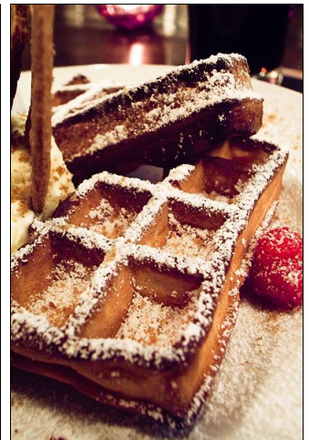
gaufre de Bruxelles