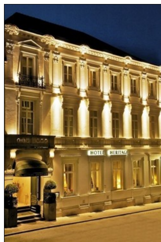
Hotel Heritage, Bruges