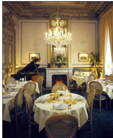
Clockwise from top left: Classic room, Hotel Amigo Breakfast room, Hotel Heritage Dining room, Hotel de l'Europe