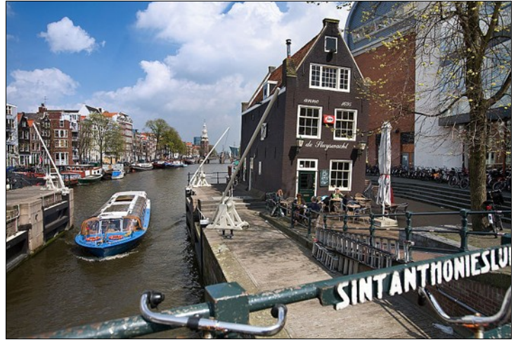
Sint Anthoniesluis Bridge, Amsterdam