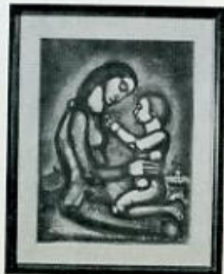
F12 M 56