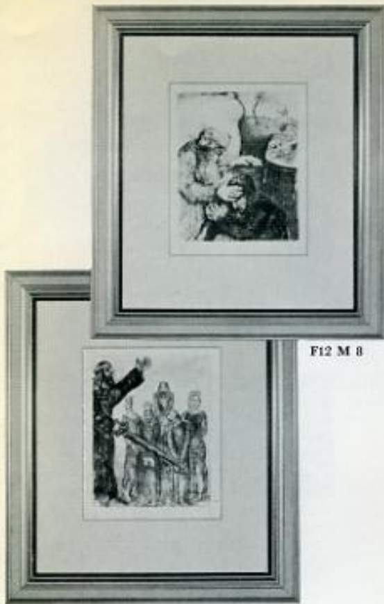
F12 M 8