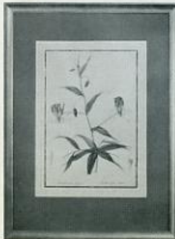
F12 M 27

F12 M 27—FLOWERS AND LILIES. Colored lithograph, green, yellow, red, and pink. Signed in the plate. 33x24 inches, framed, gilt silver with an elaborate French mat. . . . . $60