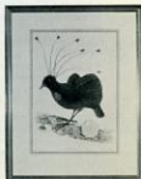
F12 M 69

Julian Trevelyan's genius is held in great esteem. In his adventurous renaissance he explores the mystical meaning and traditions of medieval Europe. Trevelyan is represented in the many major museums and private collections of modern art throughout the world . . .