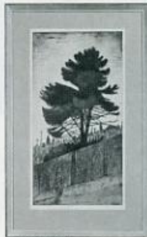
F12 M 73

F12 M 78—JESUS COLLEGE. Colored lithograph, parchment brown, white, purple. Signed and numbered. 25x32 inches, framed, contemporary, silver leaf . . . $90