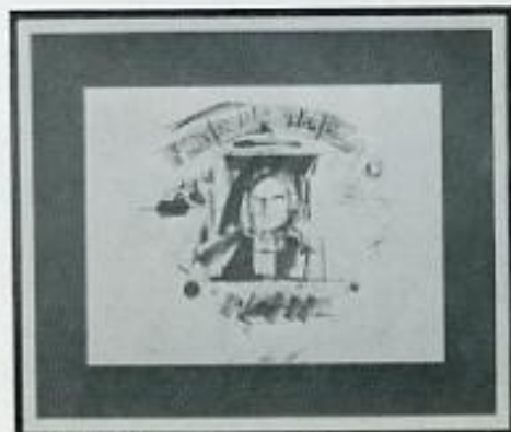
F12 M 47

F12 M 47 — WEBSTER. Lithograph, black and white. Signed and numbered. 33x38 inches, framed, ebony finish with a white insert . . . . . $95