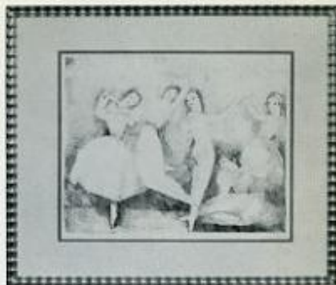
FI2 M 23

FI2 M 23—THE DANCERS. Colored lithograph, green, blue, pink, and black. Signed in the plate. 25x21 inches, framed, contemporary, gold leaf. . . . . $85