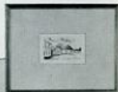
F12 M 63