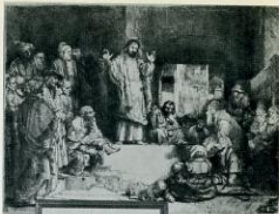
F12 M 48