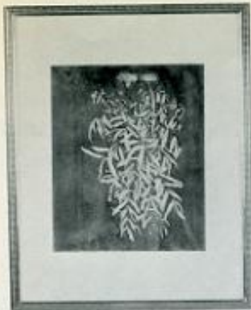
F12 M 1