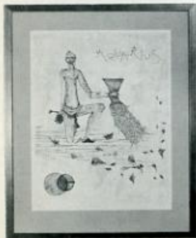
F12 M 38