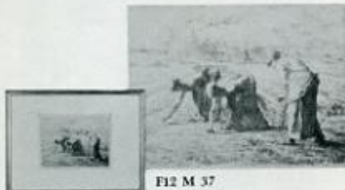
F12 M 37

PLEASE NOTE: Like Rembrandt, Millet did not sign most of his etchings. These are the last original examples of this master's work as all of Millet's plates have now been destroyed.