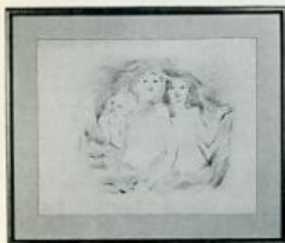
F12 M 58