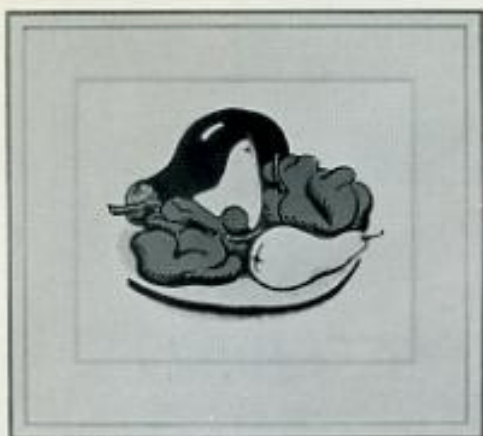
F12 M 30