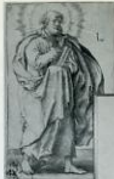
F12 M 14