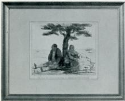
F12 M 12

NOTE: During his lifetime Daumier created more than 4000 original lithographs. Available for your own art collection are similar social and political subjects, alike in subject matter, content and feeling.