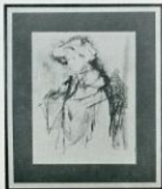
F12 M 43