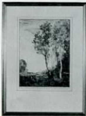
F12 M 9

NOTE: These selected etchings were never signed by Corot.