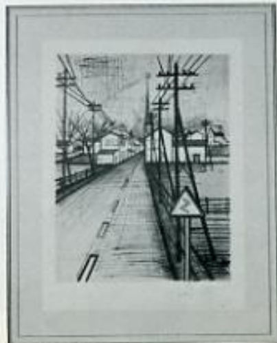
F12 M 5

F12 M 5—LA ROUTE. Colored lithograph, red, blue, black, yellow, and white. Signed and numbered. 38½x30½ inches, framed, contemporary, gold leaf, linen liner . . . . . $175