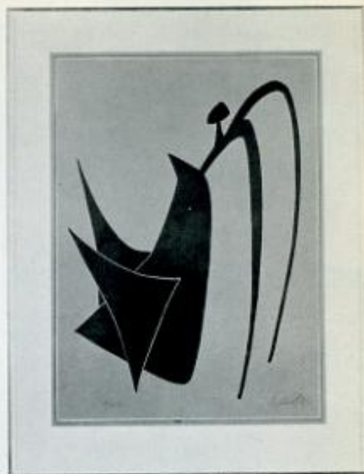
F12 M 6

F12 M 6—COMPOSITION IN BLACK AND RED. Colored lithograph, black and red. Signed and numbered. 32½x25¼ inches, framed, contemporary, gold leaf. . . . . $135