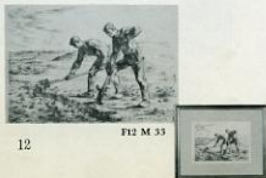
F12 M 33