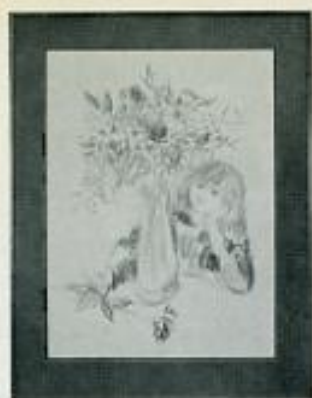
F12 M 57