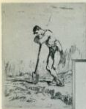
F12 M 36