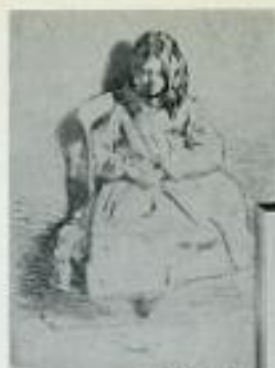
F12 M 67

F12 M 68—BILLINGSGATE. Etching, black and white. Signed in the plate. 14x9 inches, framed, antique gold. $50