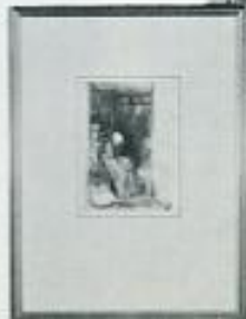
F12 M 65