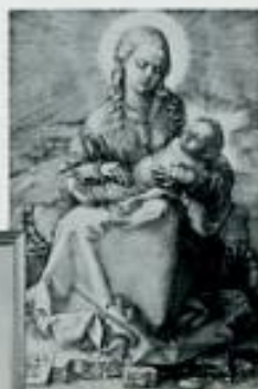
F12 M 15

F12 M 20—THE REJECTION OF JOACHIM BY THE HIGH PRIEST. Woodcut, black and white. Initialed in the plate. 15x12 inches, framed, contemporary, gold leaf... $250