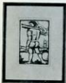
F12 M 55

NOTE: Illustrated here is one example from the famous Le Miserere and one example from The Passion . Similar themes alike in their emotional content and feeling may be purchased according to your preferences.