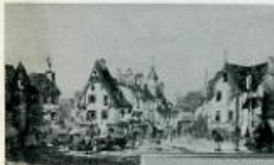
F12 M 26