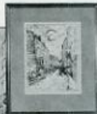
F12 M 64