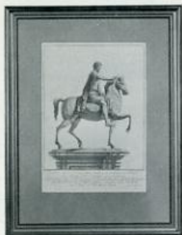
F12 M 46