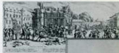
F12 M 13