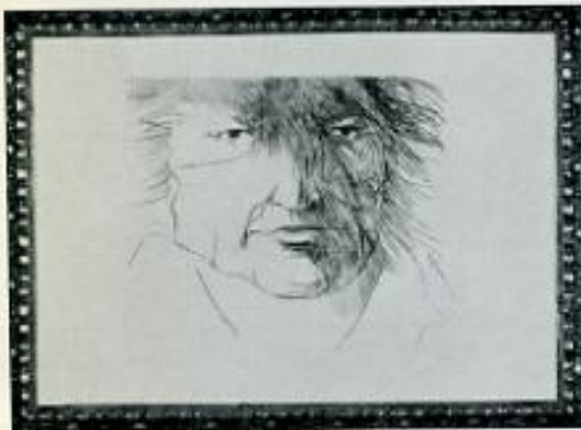
F12 M 4