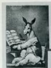
F12 M 22