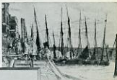
F12 M 68