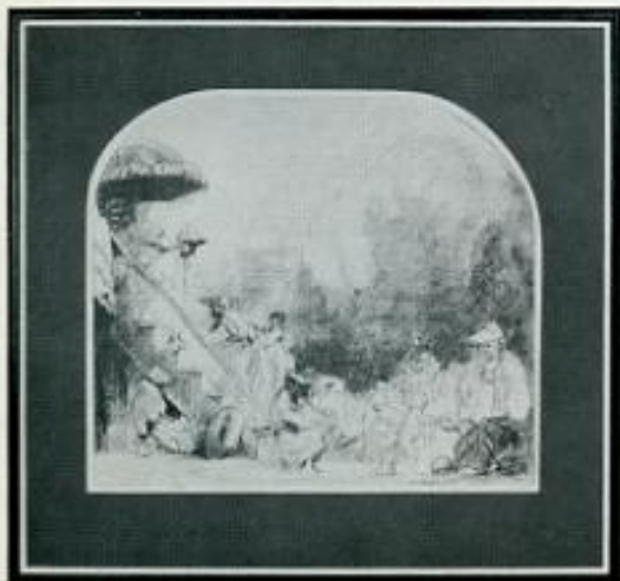
FI2 M 24