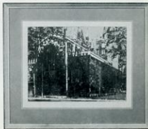
F12 M 74