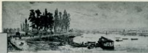
F12 M 25