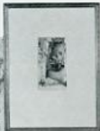
F12 M 66