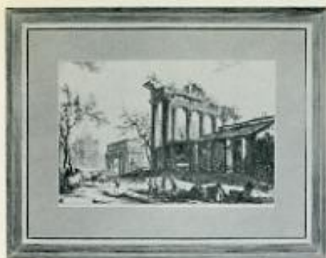
F12 M 44