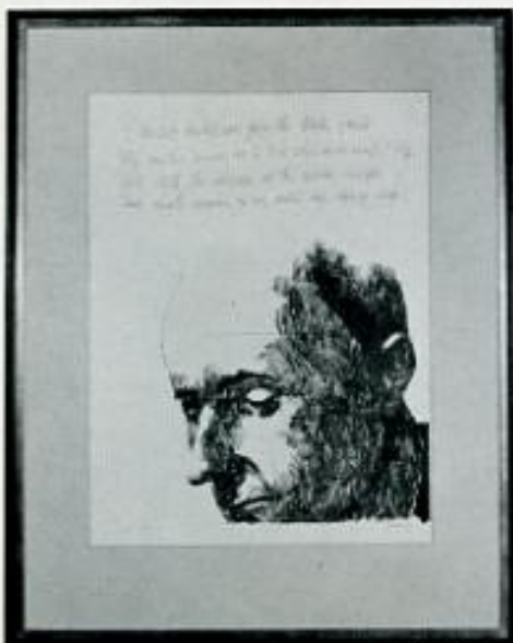
F12 M 7