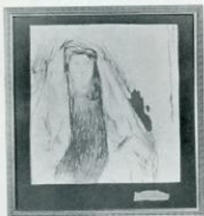
F12 M 41