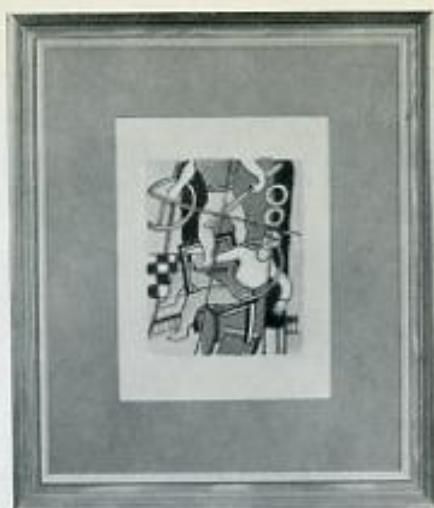
F12 M 29

NOTE: LE CIRQUE was printed posthumously.