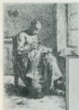
F12 M 34