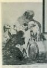
F12 M 21